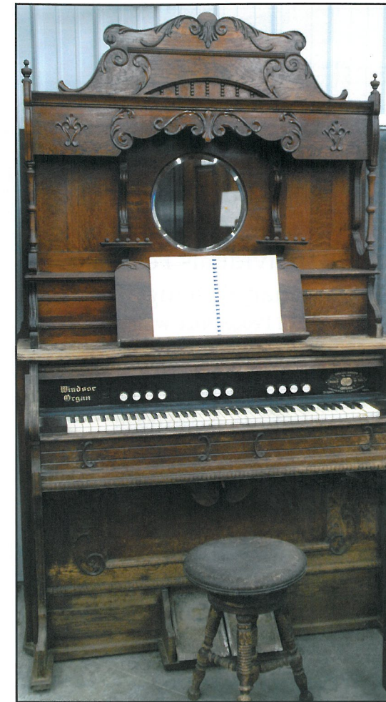
Other items include a very fancy pump organ along with stoneware like this salt feeder.