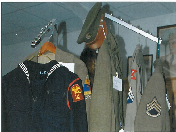
A rich history of military service is also featured in the museum as well as a incubator complete with an interesting decal.