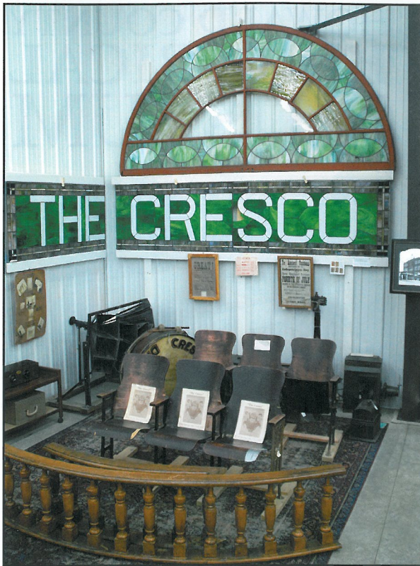
A section of the museum has the original marquee and other items from the theater.