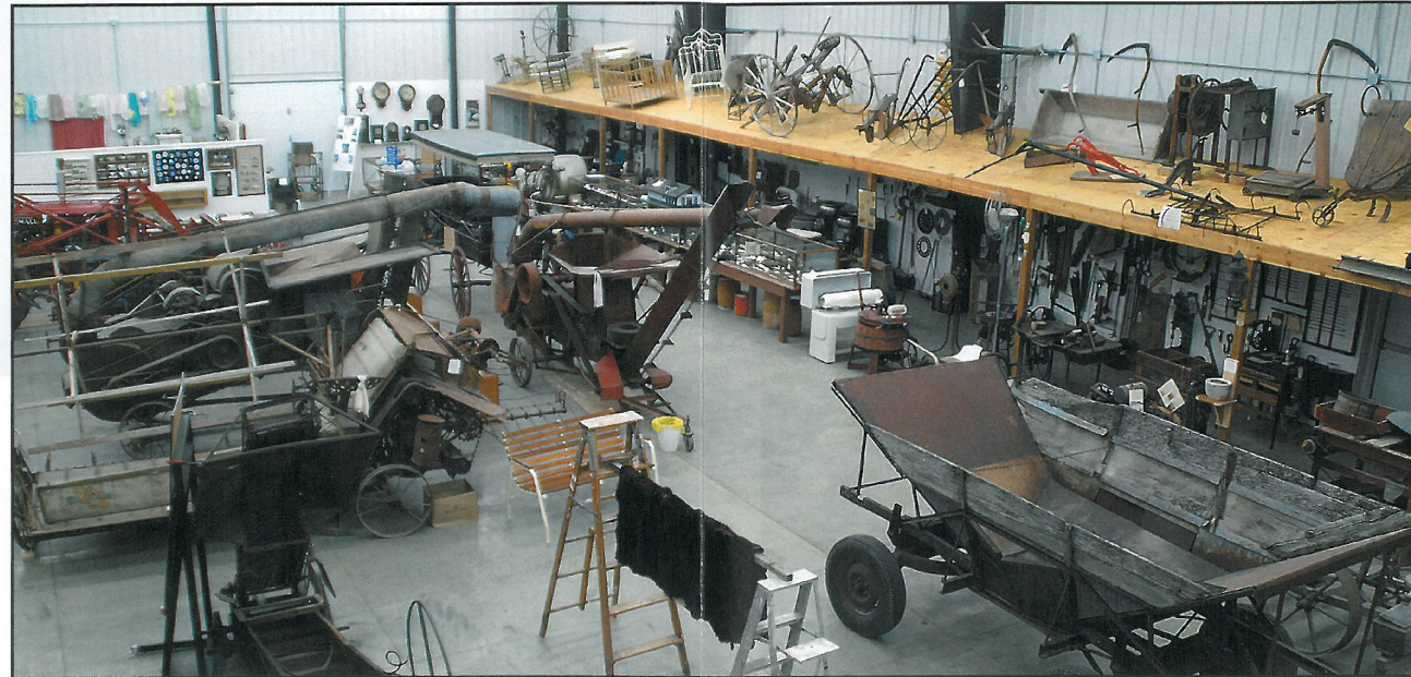
The main room reflects the rich agricultural heritage and includes big and small equipment as well as feature stories on items created and manufactured in the county. It includes a large advertising curtain from the theater.